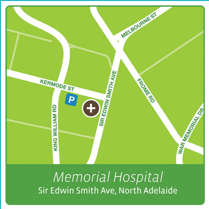
Memorial Hospital Sir Edwin Smith Ave, North Adelaide